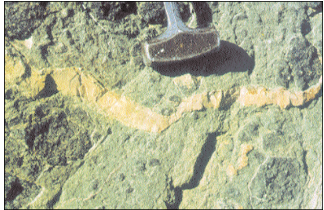
A deposit of iron mineral in southern Oman.

East of Mirbat, the geology team began its exploration of the broad, igneous-metamorphic basement complex at the east end of the broad Salalah plain, about 75 kilometers east of Salalah and 150 kilometers from Wadi Nharat. Here, almost on the outskirts of Mirbat, they made their most exciting and significant geological discovery. This