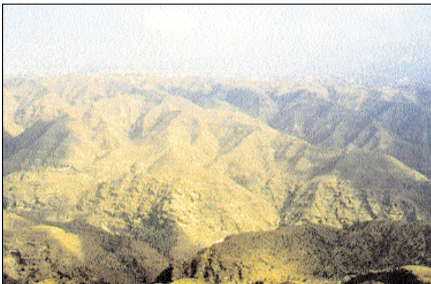
In the geology of Oman researchers may yet find other iron mineral deposits.

Although iron was known and smelting techniques were practiced, by intention or accident, before 1200 B.C., the dawn of the Iron Age saw a sharp increase in the number of iron objects, and iron gradually replaced bronze, first as farm tools and then as weapons. Two or three centuries earlier, the Hittites migrated to central Anatolia, perhaps bringing with them the secret of iron smelting from the “east.” 18 Some historians believe the Hittites exploited their monopoly of iron for military advantage, and Hittite kings wrote about iron in correspondences sent to monarchs in Assyria (Shalmaneser I) and Egypt (Ramses II). 19 About the beginning of the Iron Age, Hittite lands were overrun by a wave of the indeterminate “Peoples of the Sea” and the secret of iron passed to the Philistines, a branch of those mysterious people. 20 Other than among the Hittites, the only serious use of iron before 1000 B.C.